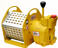
CE Model winch