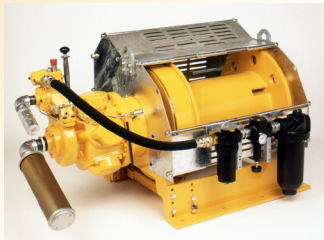
Man Rider winch

In certain cases, such as Man Rider winches and CE models (for compliance with the European Machinery Directive), drum guards are required as a standard feature in order to meet a regulation or local requirements.