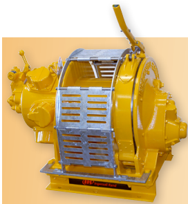
K6U (discontinued 1995)

Drum guards can also be ordered for winches as field retrofit kits.