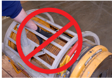
Non-Ingersoll Rand approved drum guard

The use of other than genuine Ingersoll Rand parts may result in safety hazards, decreased performance and increased maintenance and will invalidate all warranties.